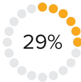
Increase in Average Total Recovery Savings